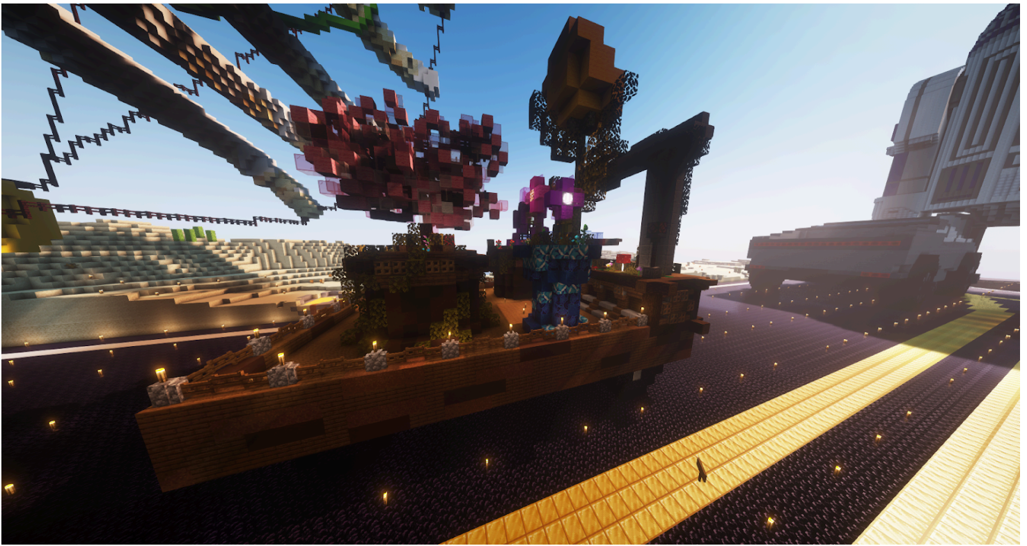
^Migration 2 (archive)