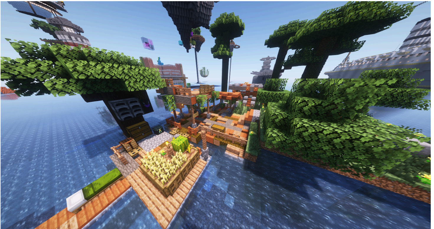
^ Fort Concorde barge build (archive)