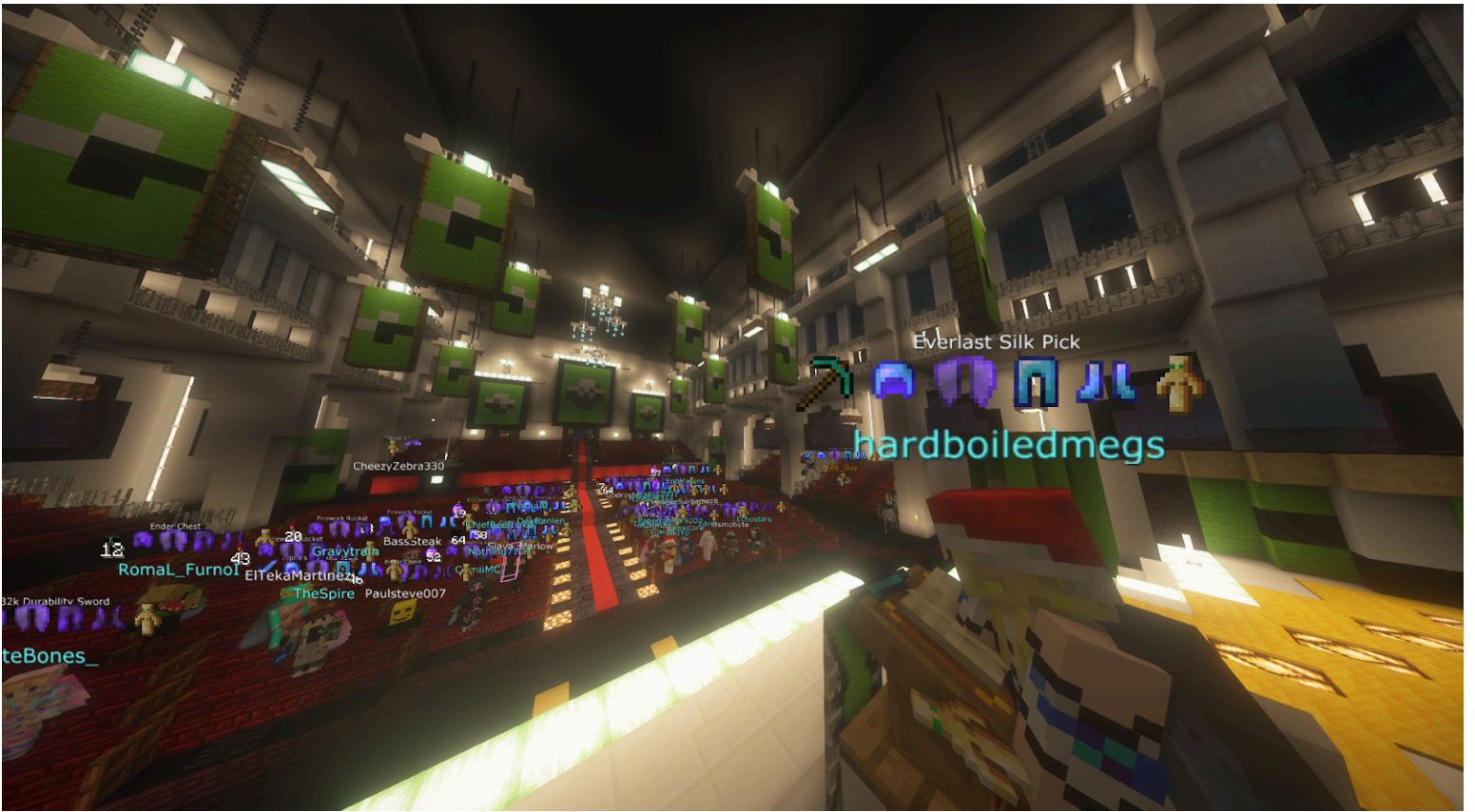
^ SBA Awards event 2023