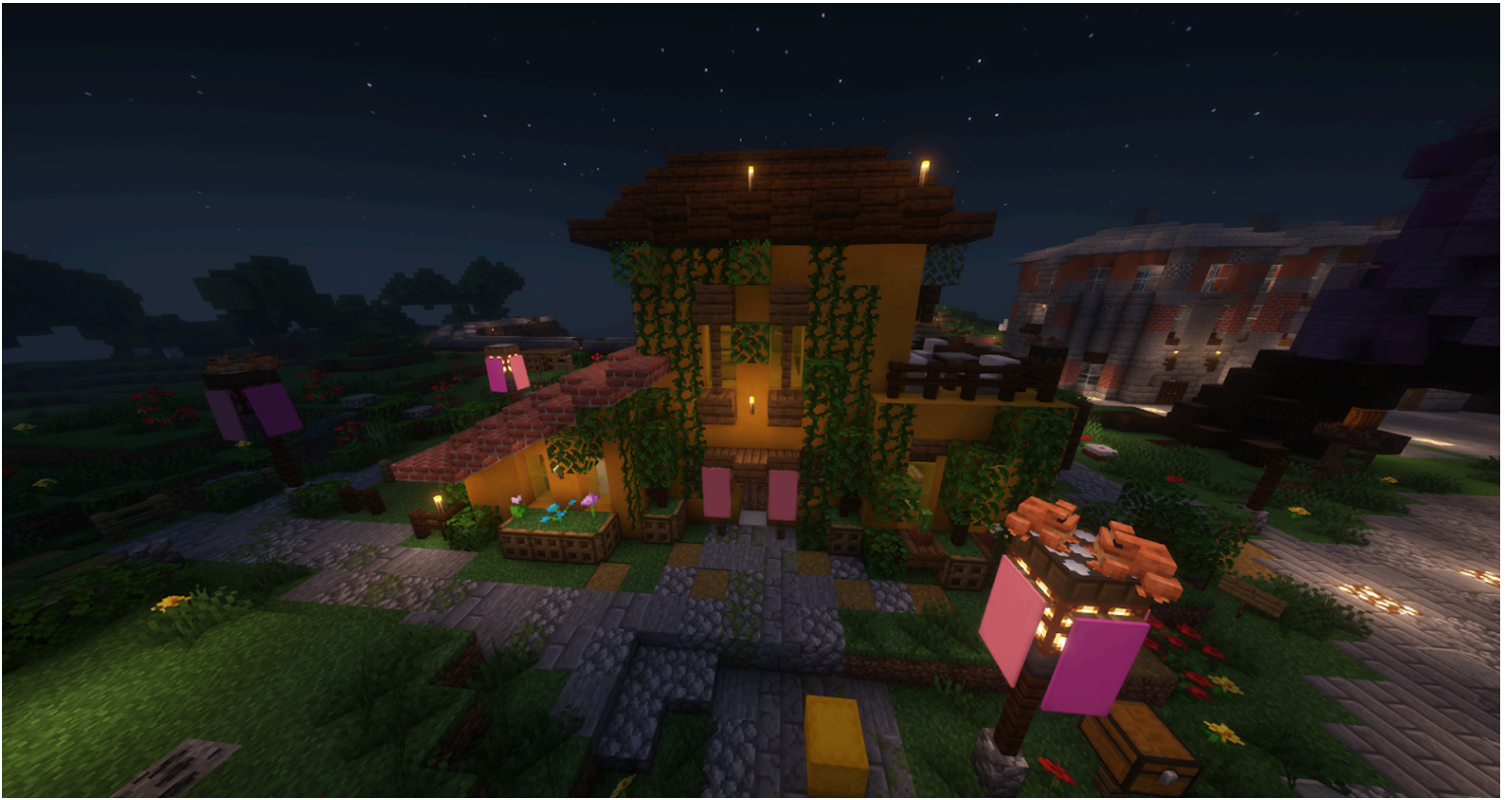
^ SBA 55 Build (archive)