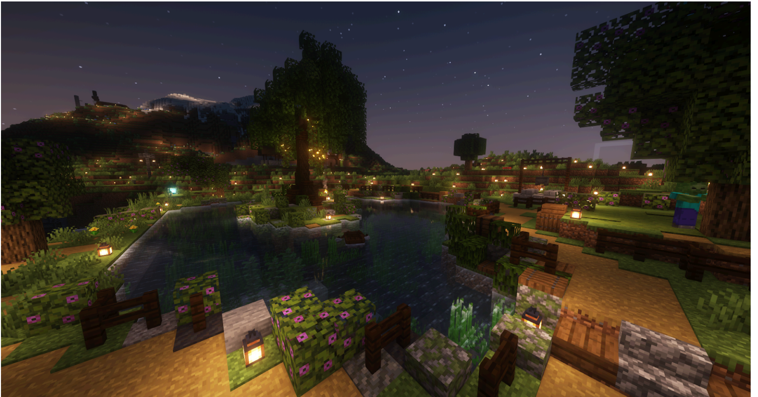
^ Lens Base builds