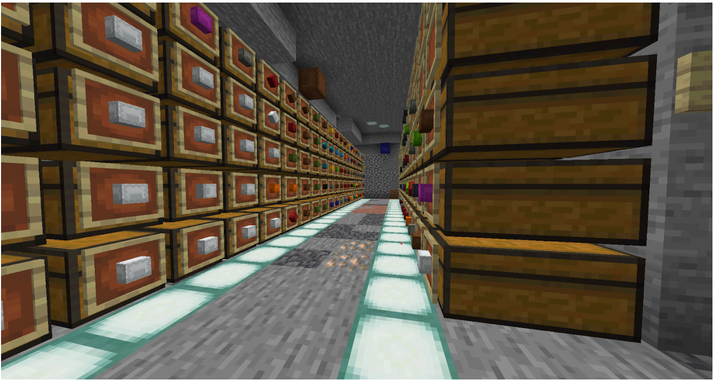
^ my old stash