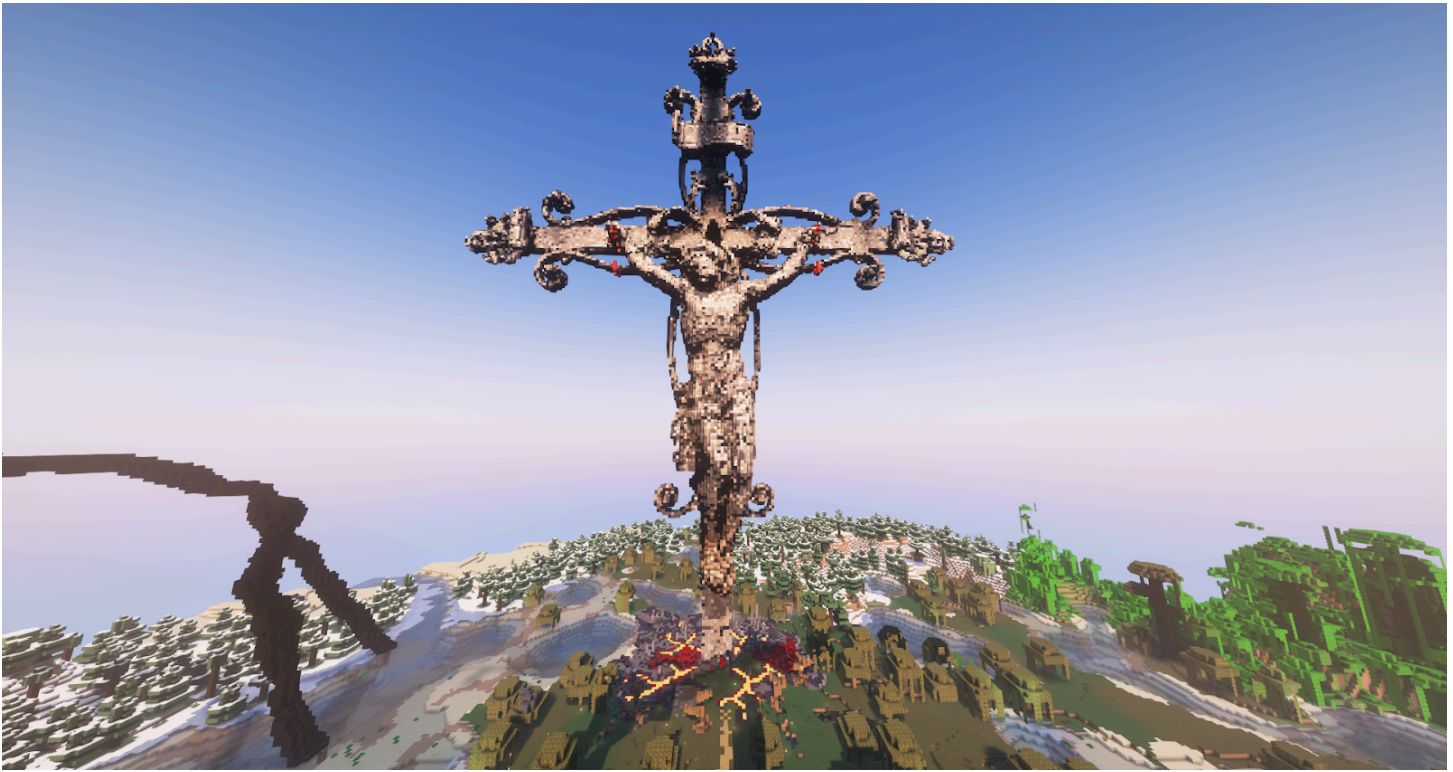
^ Halloween 2023 Party Committee build (archive)