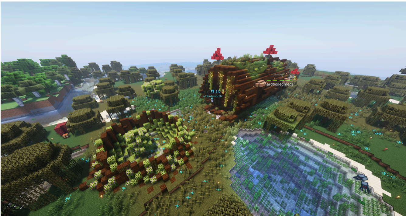
^ Log Lodge by me & 1drw & OLN