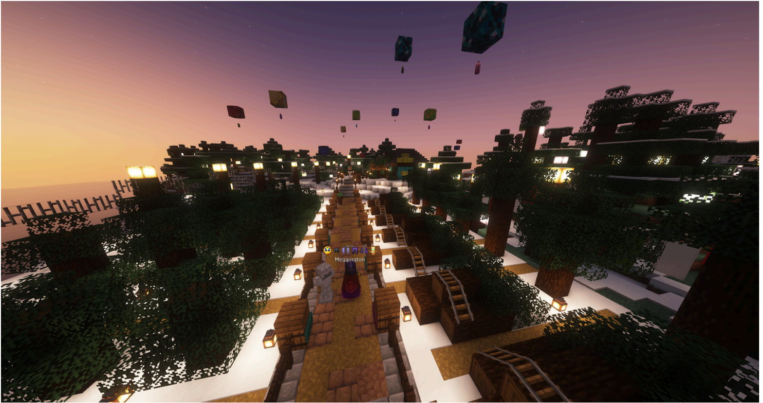
^ Christmas 2023 Party Committee Build (archive)