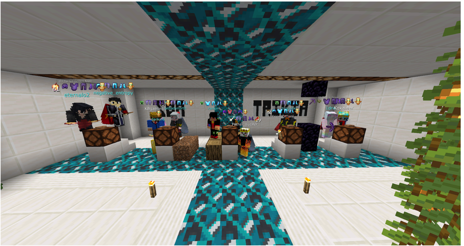
^ SBA Trivia 2024